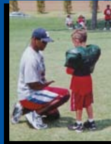
BRADIE JAMES Linebacker, Dallas Cowboys