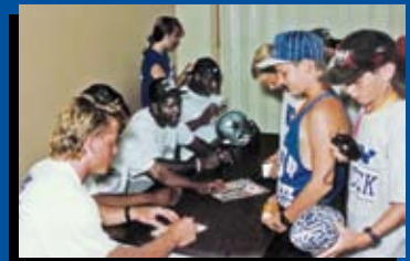
COWBOYS AUTOGRPH SIGNING