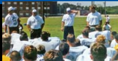
JAY NOVACEK & MEMBERS OF COWBOYS