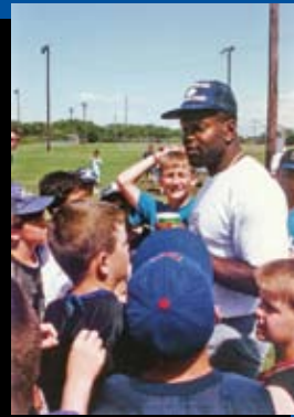
EMMITT SMITH Former Running Back, Dallas Cowboys