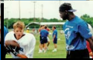
MICHAEL IRVIN Former Wide Receiver, Dallas Cowboys