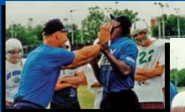
JAY NOVACEK & MICHAEL IRVIN Dallas Cowboys