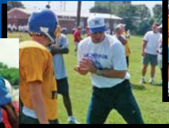
TROY AIKMAN Former Quarterback, Dallas Cowboys